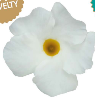
IMPR. WHITE 16