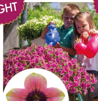
GREEN EDGE PURPLE