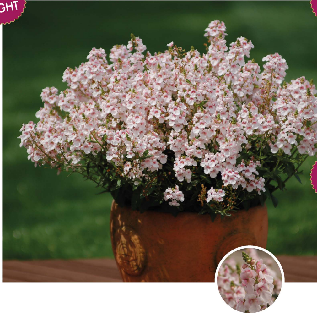
SAKURA PINK (2015)