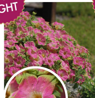
GREEN EDGE PINK