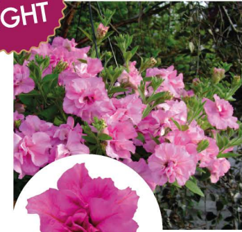
DOUBLE DARK PINK