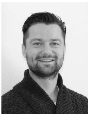
Erwin Giezen Marketing & DTP