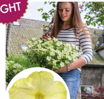
GREEN EDGE LIME