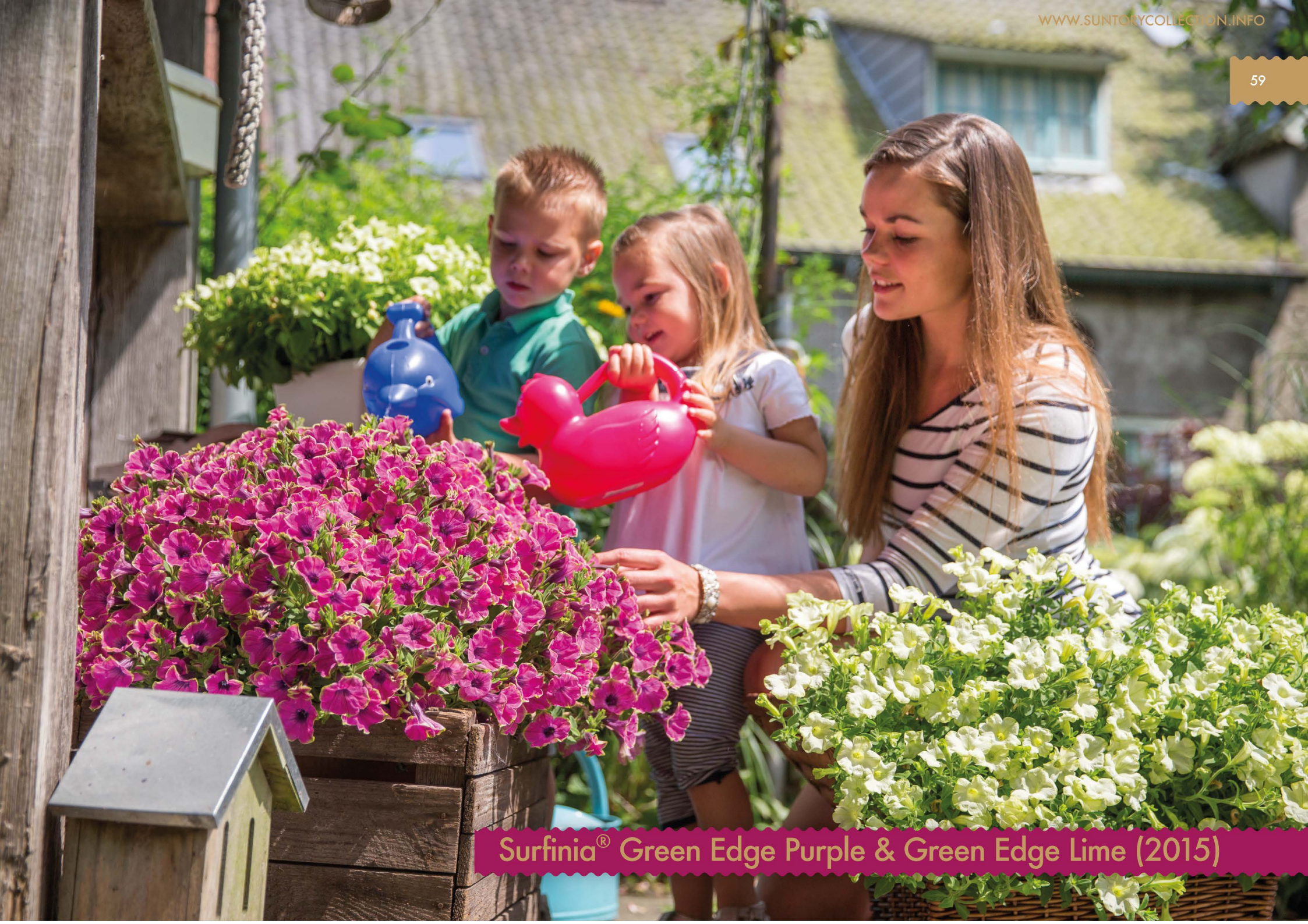
Surfinia® Green Edge Purple & Green Edge Lime (2015)