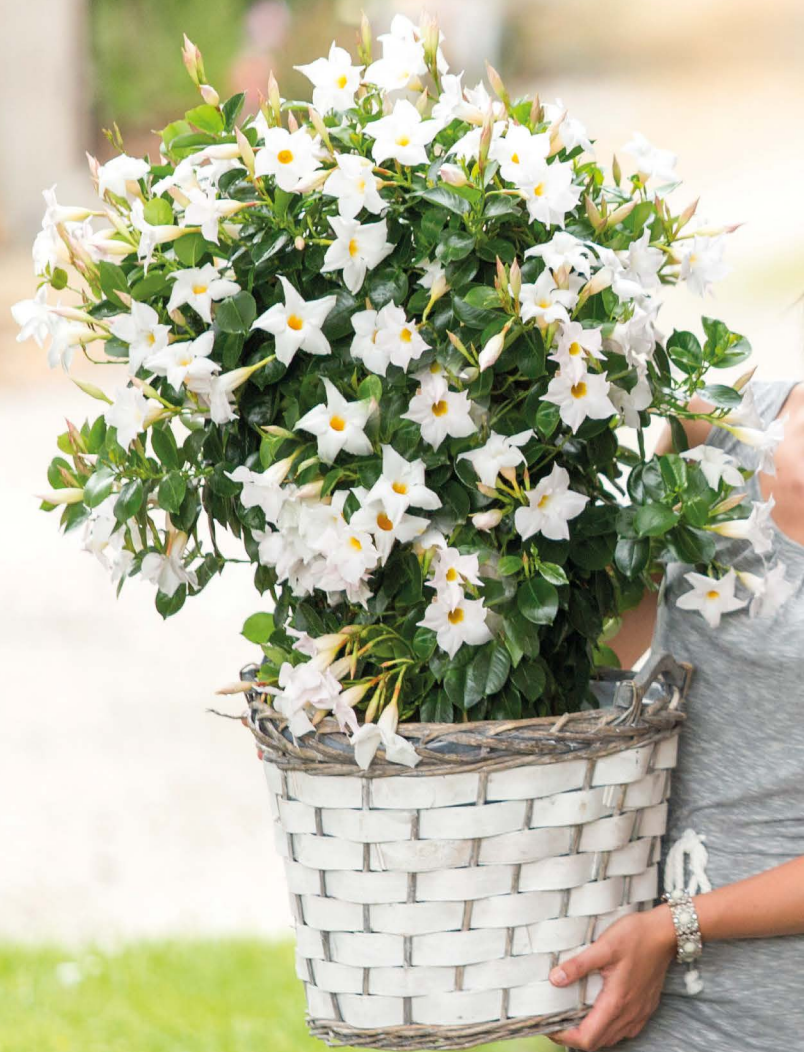
Sundaville® Pearl (2015)