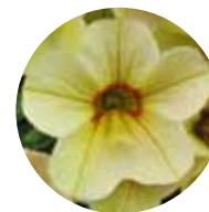
Bouquet Yellow Eye