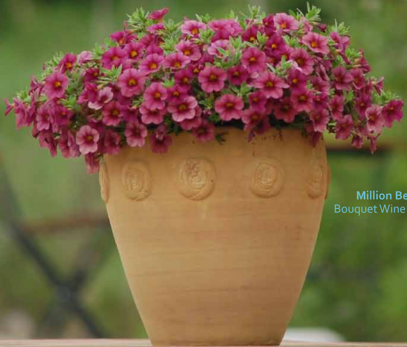
Million Bells® Bouquet Wine Red