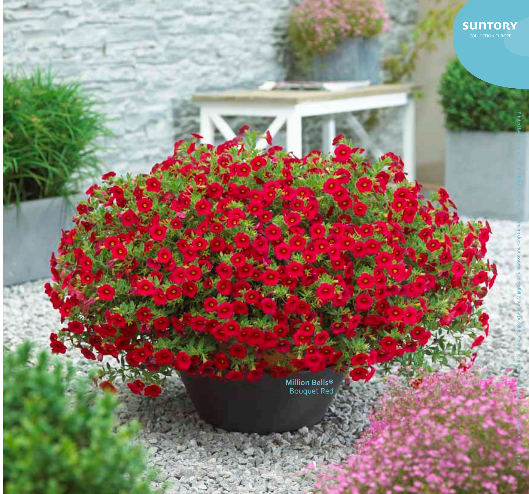
Million Bells® Bouquet Red