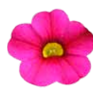
Bouquet Brilliant Pink