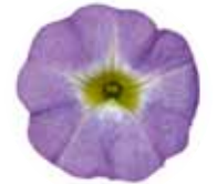
Trailing Sky Blue